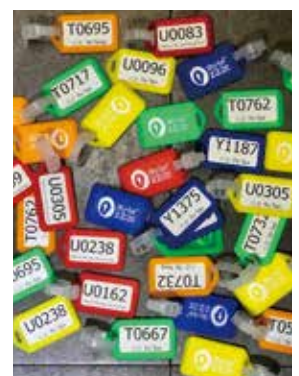
*Reusable baggage tags