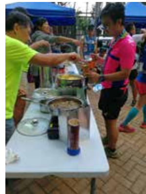
*Encourage participants to bring their own tableware