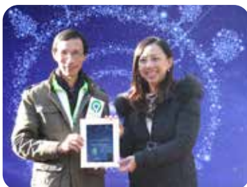
*Electronic certificates are displayed on a tablet on-site and will be sent to participants' emails in real time.