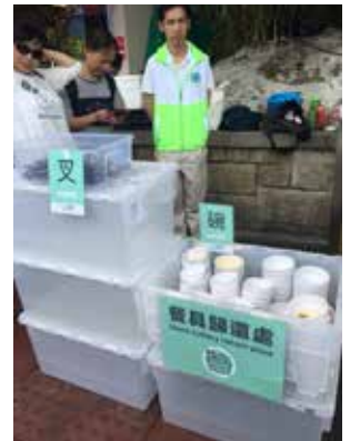
*Tableware Rental Company to support outdoor events