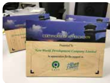
*Certificates made of used wooden wine boxes