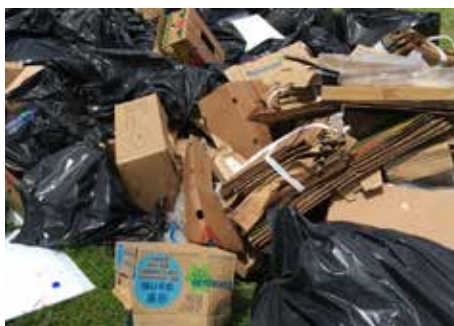
*Lack of efficient and clear communications, recyclable resources will end up as waste.