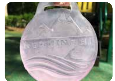
*Practical handmade soap as a finisher medal