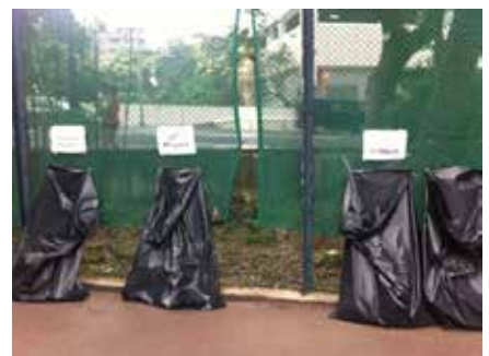
*Black plastic bags to collect recyclable materials can lead to participants' mistaking them as garbage bags.