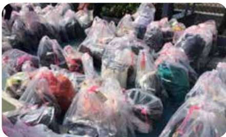
*Encourage participants to keep the bags for reuse and remind them to remove the ropes, buttons and tags before recycling.