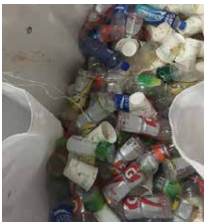
*If organizers distribute large amount of disposable tableware on-site without green-ambassadors overseeing the recycling facilities, it stands a high chance that the recycling bins will end up as rubbish bins.