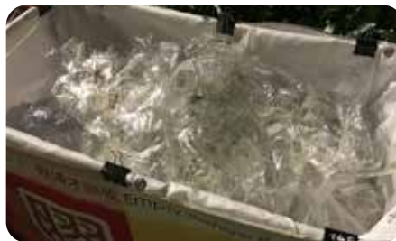
*Packaging plastic bags are often generated from events. Most of them are clean which can be reused or recycled.